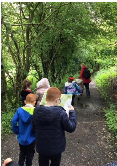
'God is my strength, in whom I trust.' Psalm 18