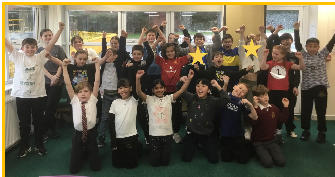
St Catherine Class