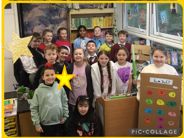
St Elizabeth Class