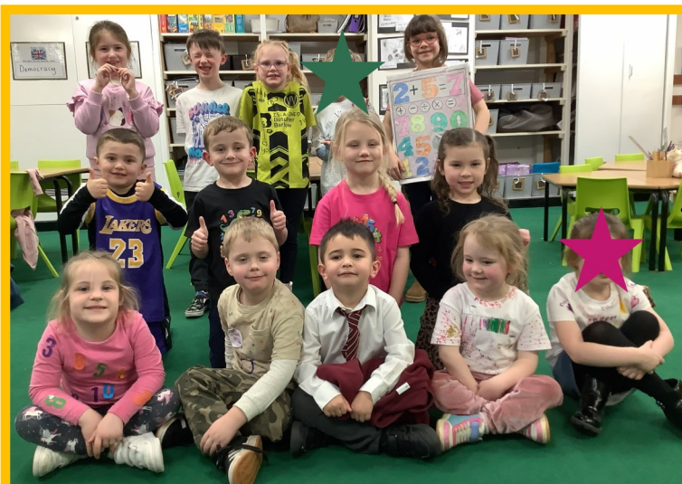
St Mary Class