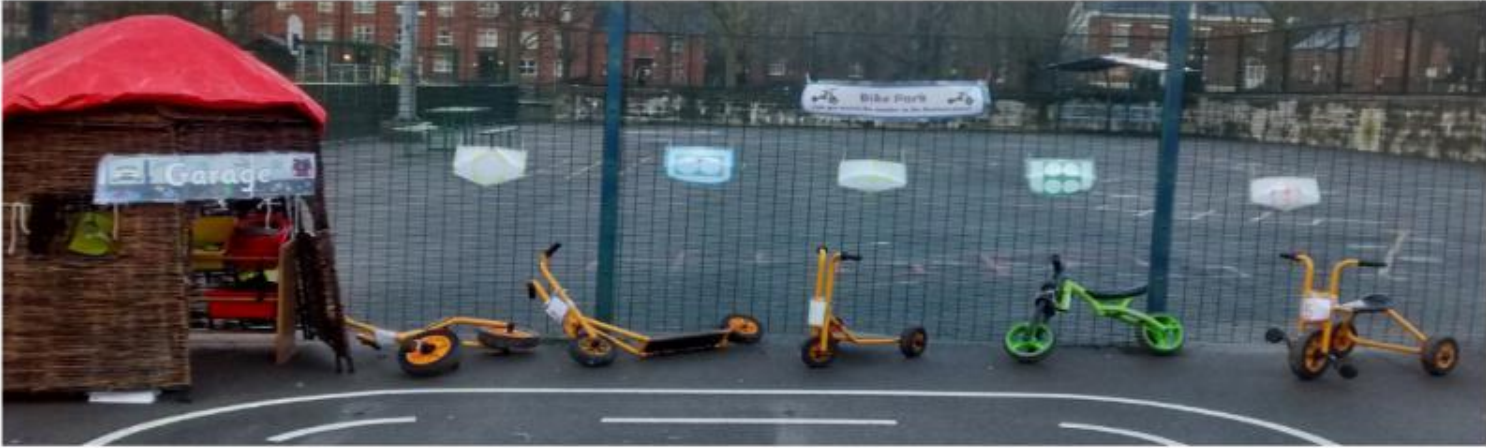
Children have the ability to access the curriculum outdoors too, on a larger scale.