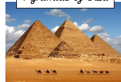
Oldest of the 'Seven Wonders of the Ancient World'.