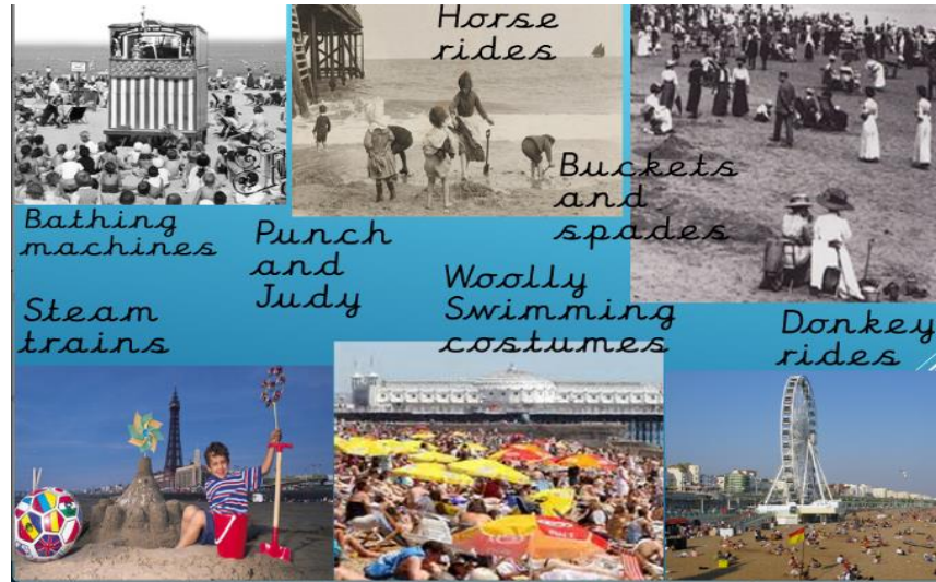
Seaside Holidays - Then (Past) and Now (Present)