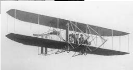
The First Aeroplane