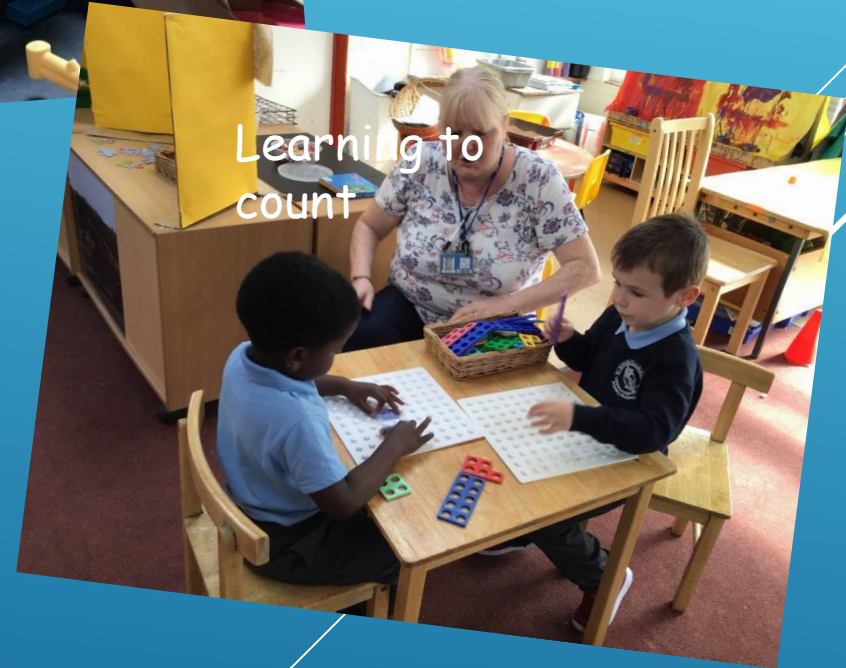
Learning to count