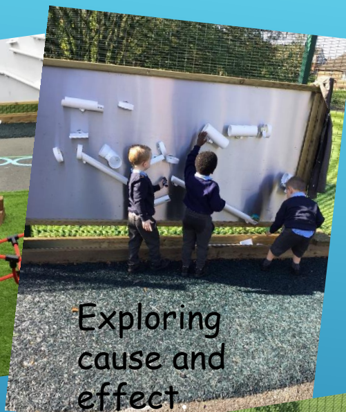
Exploring cause and effect

We have been learning about sharing toys and making new friends.