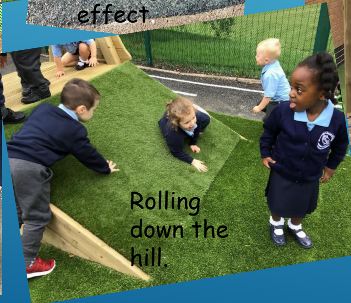
Rolling down the hill.