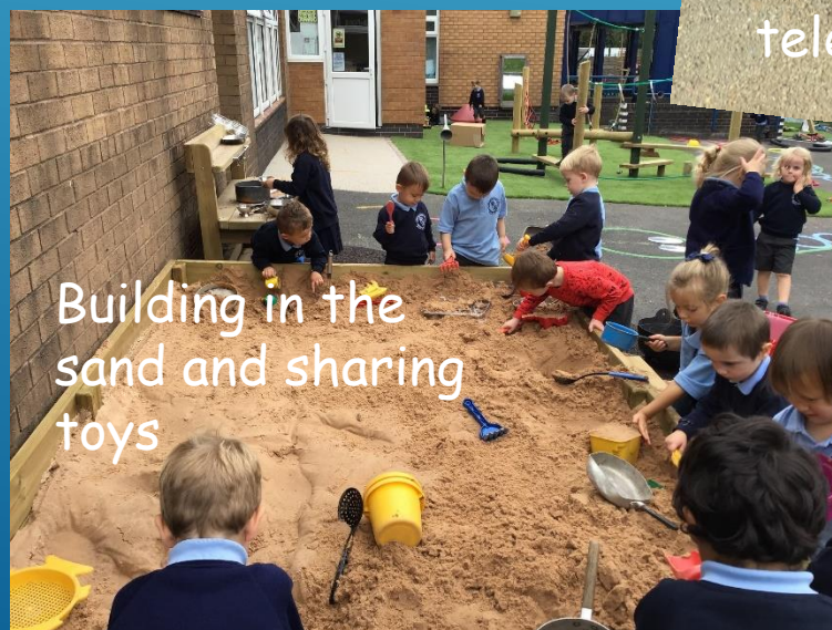
Building in the sand and sharing toys