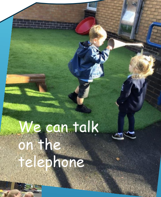
We can talk on the telephone

We have been learning about 'Ourselves' and how our bodies work.