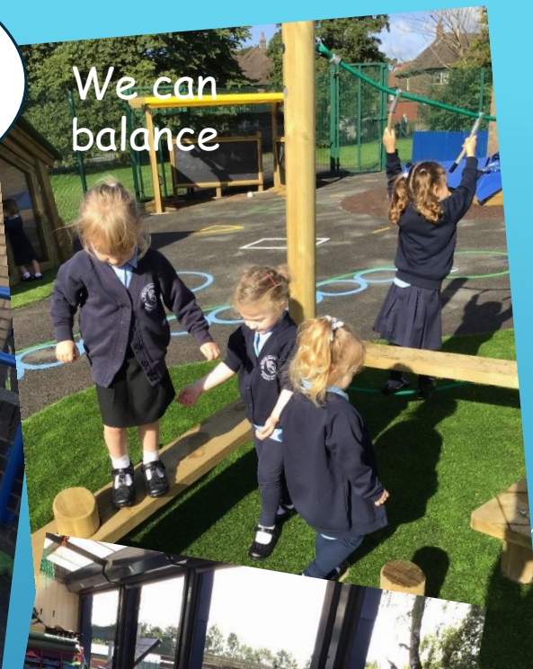
We can balance