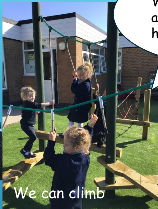
We can climb

We have been learning about 'Ourselves' and how our bodies work.