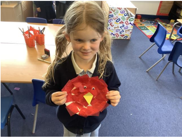
‘Little Red Hen’