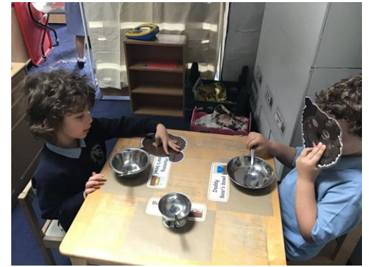
‘Goldilocks and the Three Bears’

During our topic ‘ Once upon a time... ’ We looked at many traditional tales.