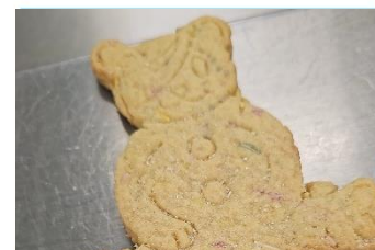
Children in Need

We would like to begin by saying a huge thank you for your generous contributions to Children in Need last week. We've raised £200 for such a worthwhile cause. The children thoroughly enjoyed the chance to come to school in their own clothes and pyjamas, and enjoyed the fun atmosphere, we hope everyone enjoys watching the show tonight.