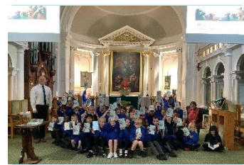
New starter Bible presentation