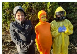
World Book Day