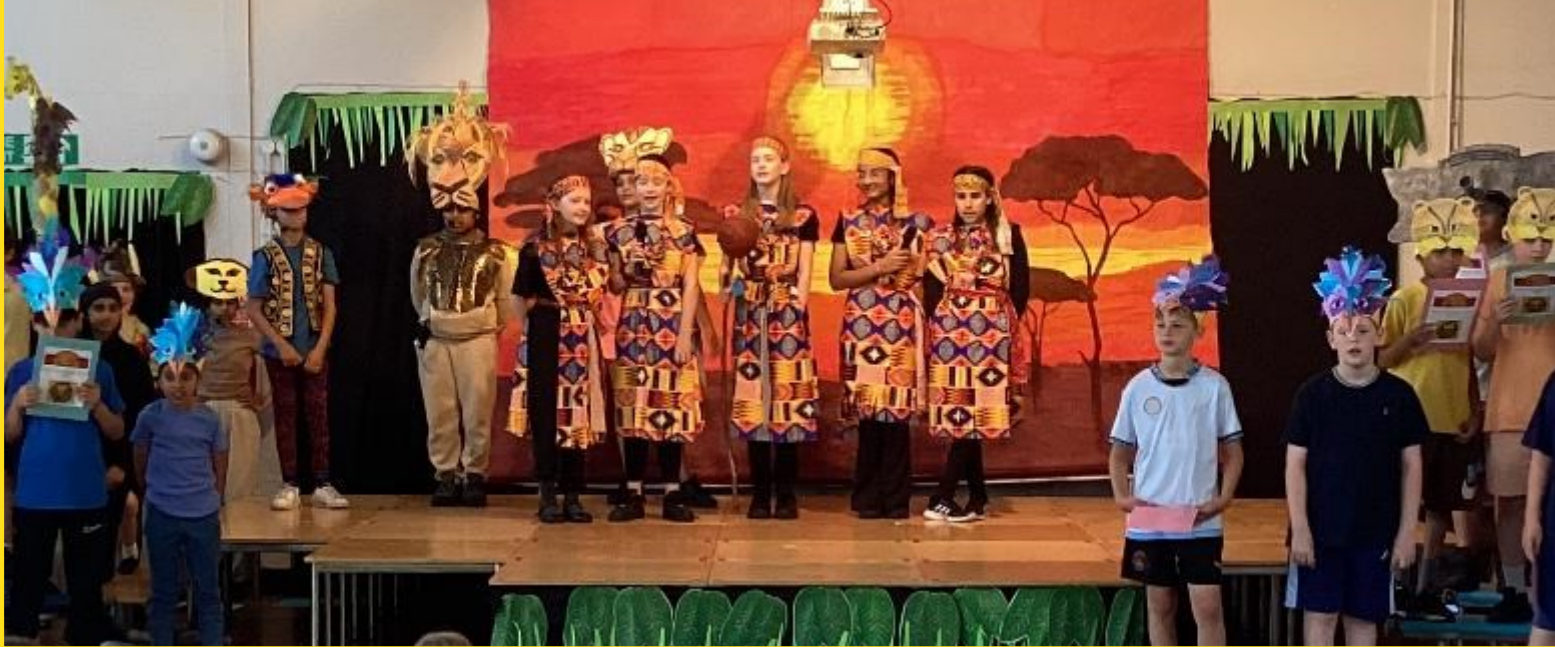
Year 6 have been busy rehearsing their end-of-year production of The Lion King , bringing the story to life with energy and teamwork.