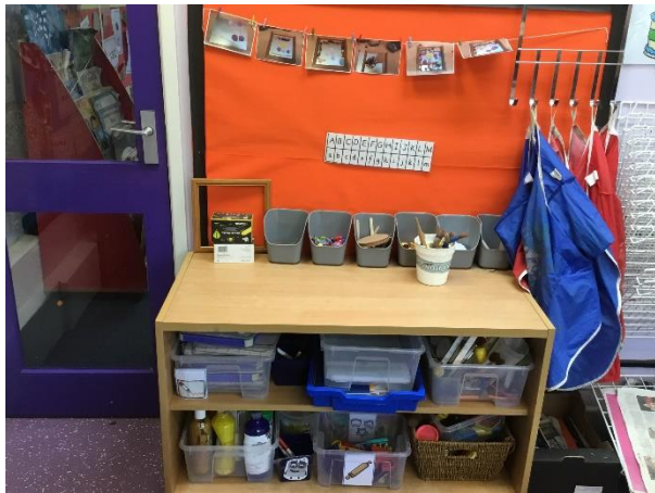
creating pictures, painting, playdough and crafts.