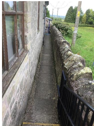
We like to go out through our door to our outside area.