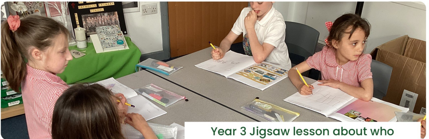
Year 3 Jigsaw lesson about who does jobs at home