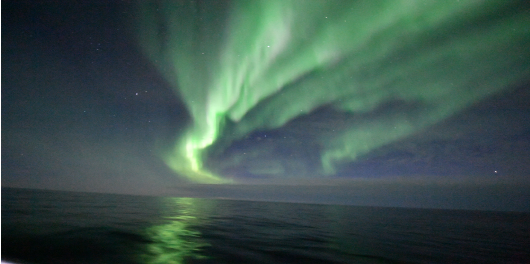
taken during the Polar Ocean Challenge.