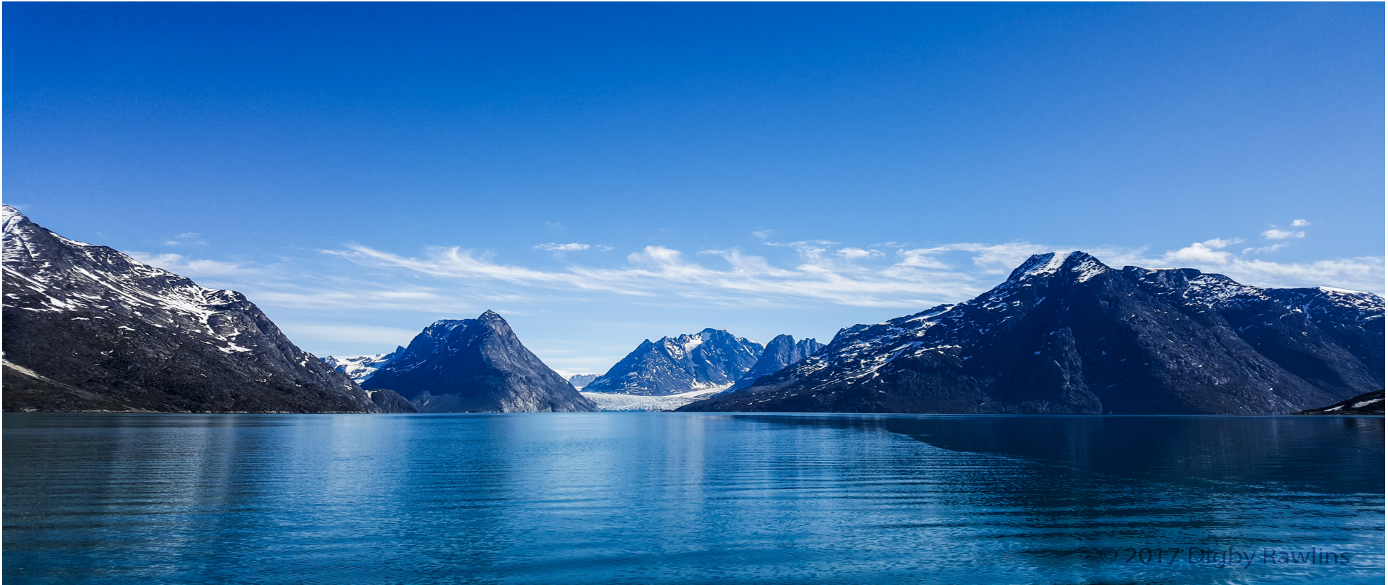
taken during an expedition to Greenland.