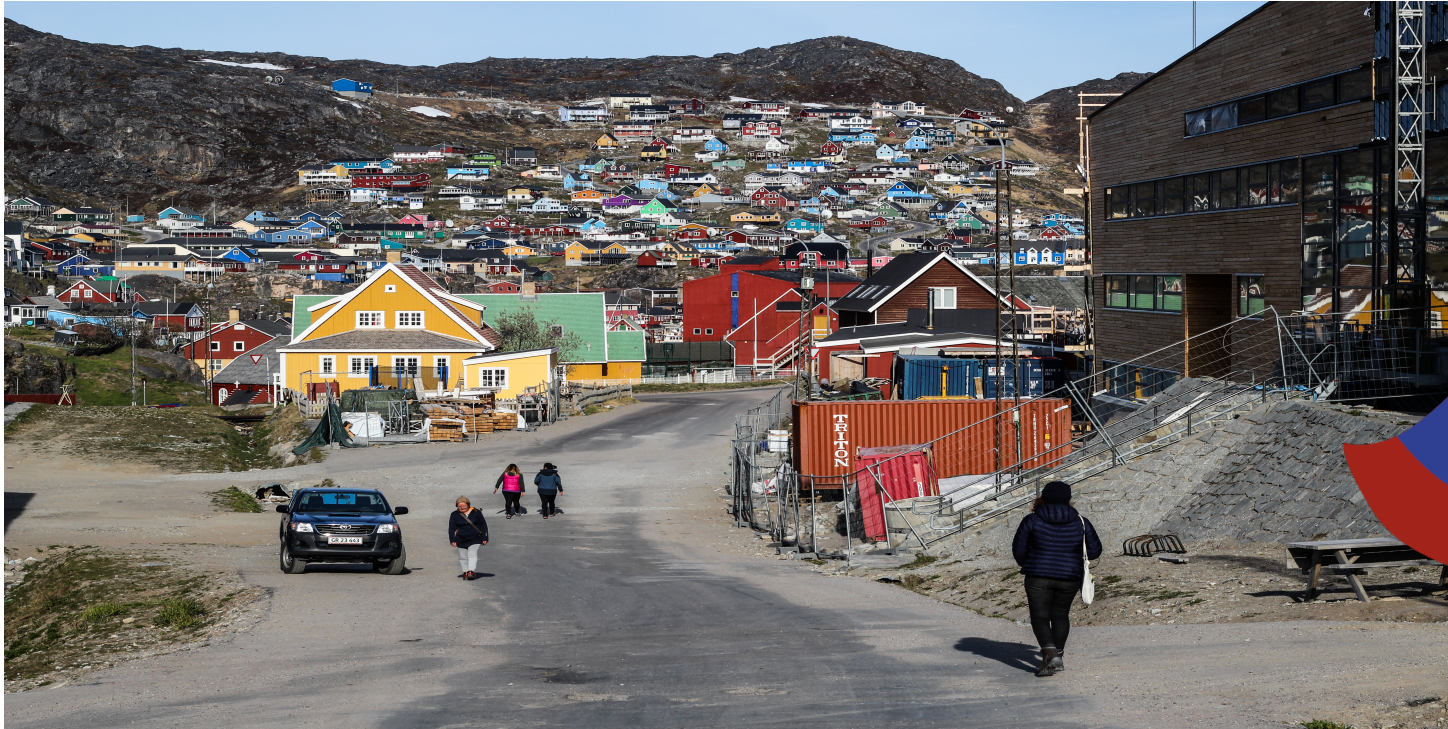
taken during an expedition to Greenland.