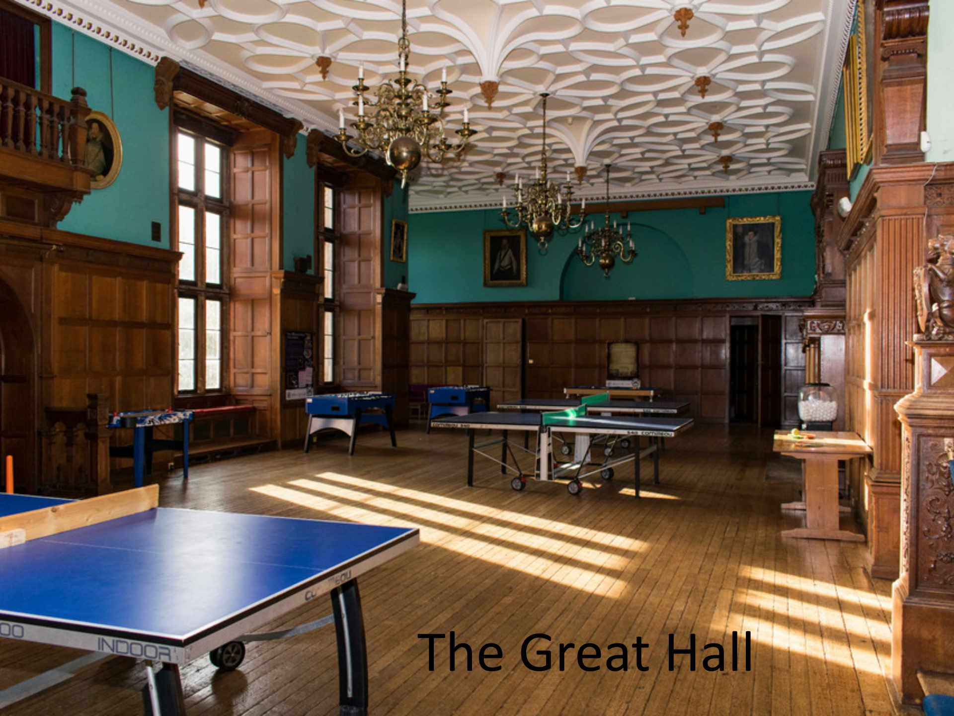
The Great Hall