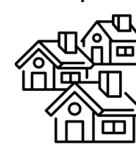
Settlements and Buildings