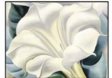
The White Flower (1932) by Georgia O'Keeffe

In Art we are painting, pupils will examine in detail a part of a flower using magnifiers and viewfinders before sketching and then enlarging it. They will develop the techniques of overpainting and wet-on-wet, as well as make tertiary colours. They will respond to the work of artists.