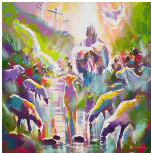
Jesus The Good Shepherd

We are asked to follow him, listen to his voice, and in doing so, we will have the fullness of life.