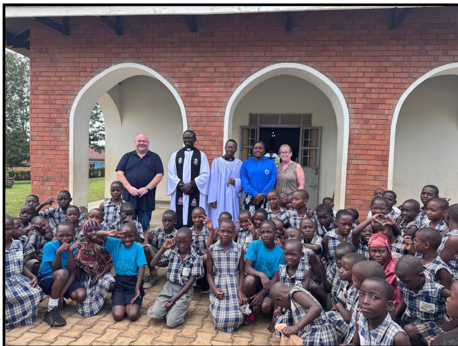
Outside Bufunda School after Wednesday Church Worship.