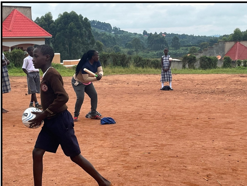
PE Teacher at Bufunda teaching rounders to the children.