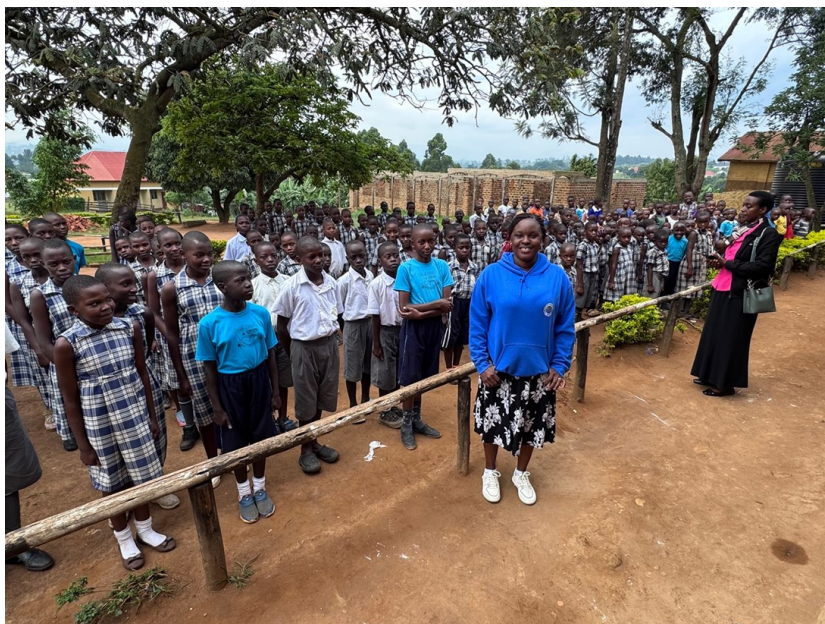
Bufunda School Assembly.