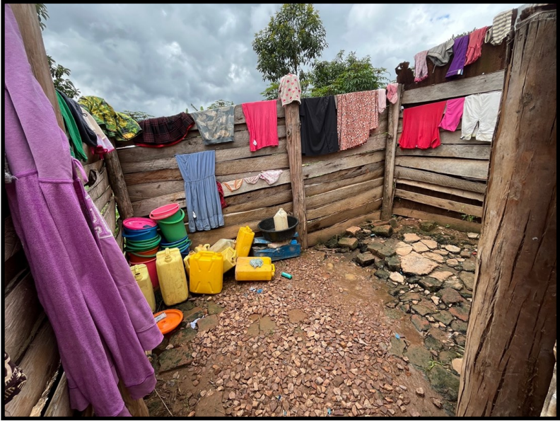
The Girls wash room at Bufunda School.