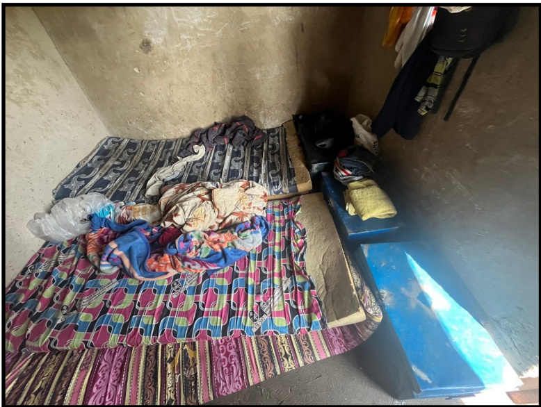
The boys dorm room at Bisiche School, 8 boys are sleeping here.