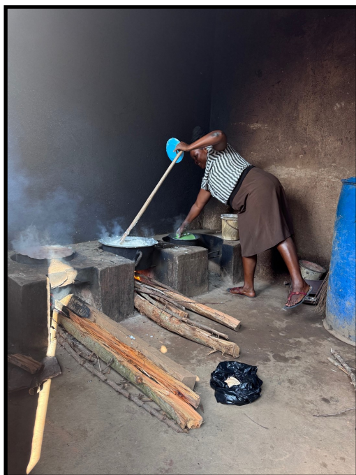
The kitchen at Nkondo Primary School .