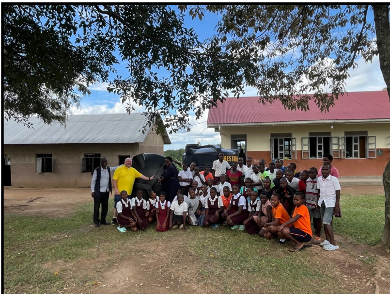
A delivery of new water tanks delivery at Bugarama School.