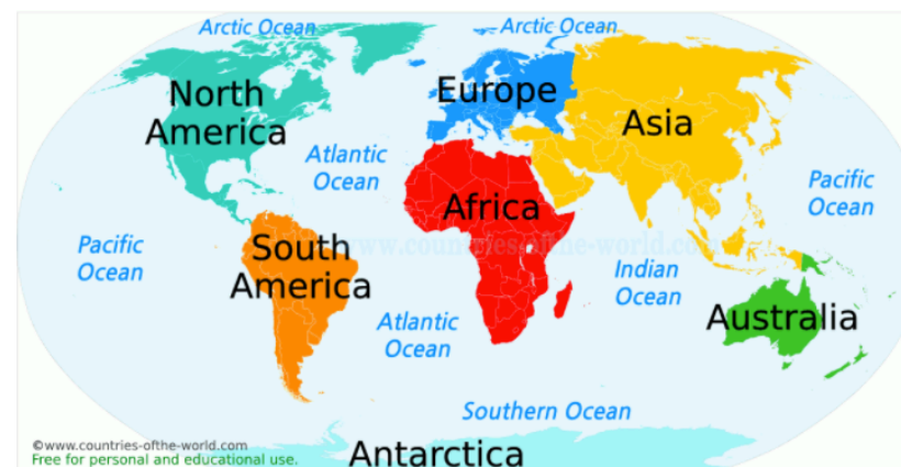
Map of the world: Antarctica is in the South Pole.

It is the warmest season of the year with more sunshine and the days are longer than the nights.