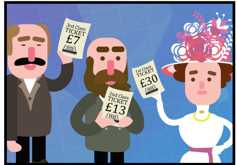
1st, 2nd and 3rd class passengers