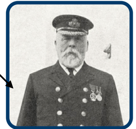
Captain Edward Smith