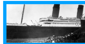
The Titanic sank in 1912