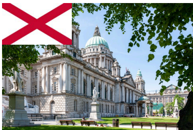
The population of Northern Ireland is around 1.8 million. The capital city of Northern Ireland is Belfast. The population of Belfast is more than 280,210.

The population in the UK is not distributed evenly across the four parts.