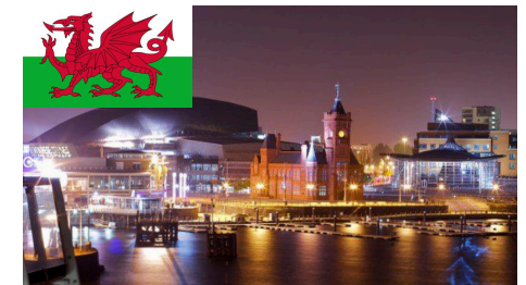
The population of Wales is around 3.1 million. The capital city of Wales is Cardiff. The population of Cardiff is more than 335,150.