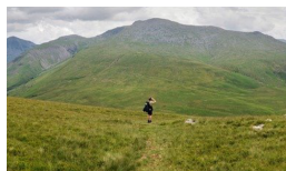
Scafell Pike, England