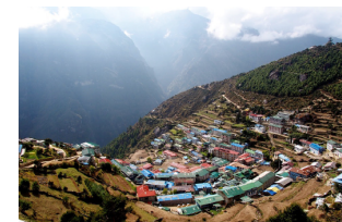
Village on the slope of the Himalayas