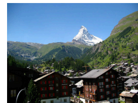
Hotels in the Alps for tourists