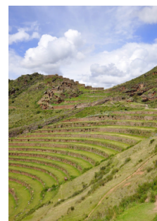
Terraced farming, Peru