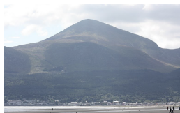
Slieve Donald, Northern Ireland