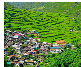
Rice fields, Philippines