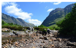
Ben Nevis, Scotland