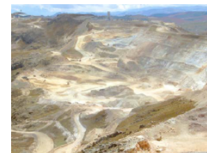
Copper and tin mines, Peru