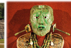
The Myan Ruler Pakal