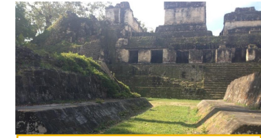
A Mayan ballcourt.