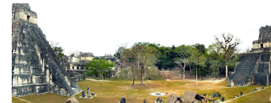
A Mayan plaza.