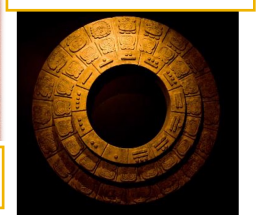
The Mayan Calendar