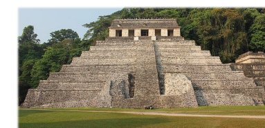
A Mayan temple-pyramid