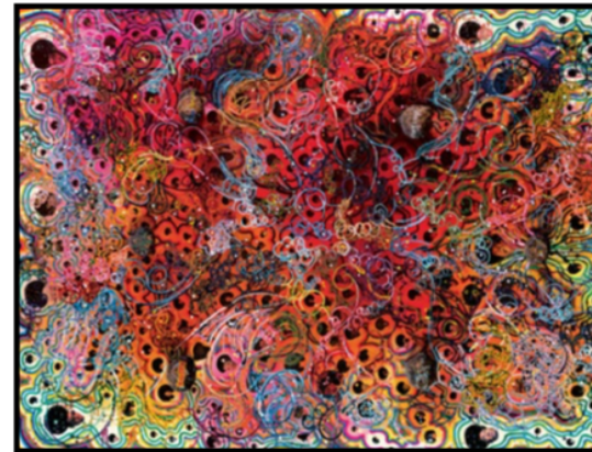
Chris Ofili is a British artist best known for his paintings incorporating elephant dung.