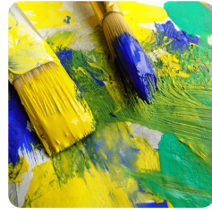
Art and design Colour Theory