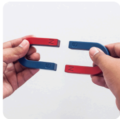
Science Forces and Magnets