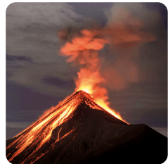
Geography Rocks, Relics and Rumbles