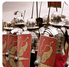
History Emperors and Empires