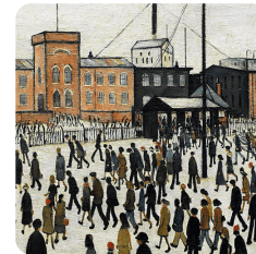
Art and design People and Places