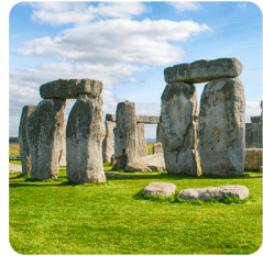
History Through the Ages