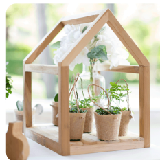
Design and technology Greenhouse