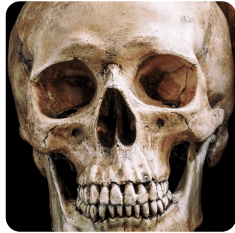
Science Animal Nutrition and the Skeletal System