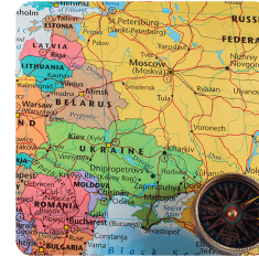
Geography One Planet, Our World