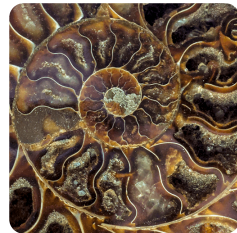
Art and design Ammonite