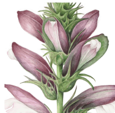
Art and design Beautiful Botanicals