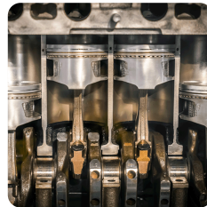
Design and technology Making It Move