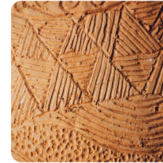
Art and design Prehistoric Pots