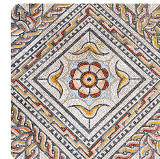
Art and design Mosaic Masters