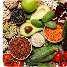
Design and technology Cook Well, Eatwell