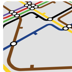
Geography Interconnected World