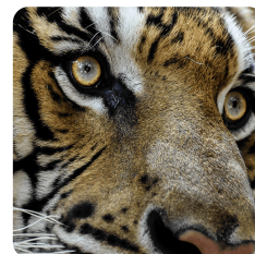
Art and design Animal