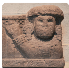
Art and design Statues, Statuettes and Figurines