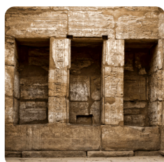
Design and technology Tomb Builders