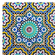
Art and design Islamic Art