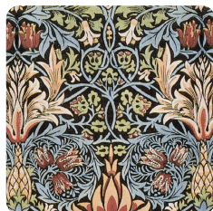
Design and technology Functional and Fancy Fabrics