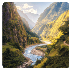
Geography Misty Mountain, Winding River