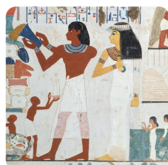
History Ancient Civilisations