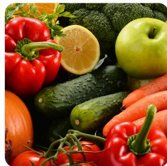
Design and technology Fresh Food, Good Food