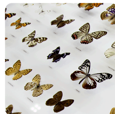
Science Grouping and Classifying