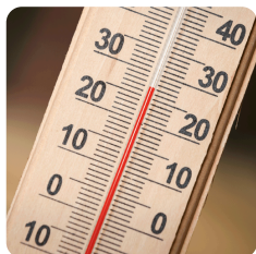
Science States of Matter