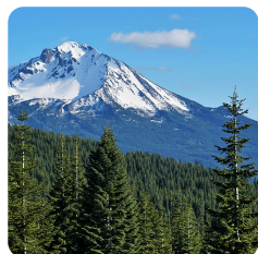
Art and design Vista