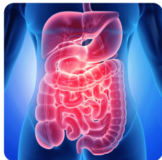
Science Food and the Digestive System