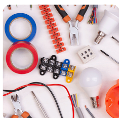
Science Electrical Circuits and Conductors