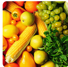
World Ready Steady Grow