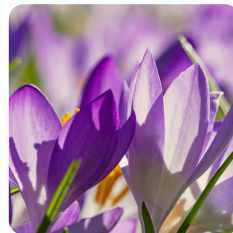
World Signs of Spring