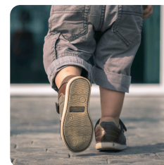
PSED Moving On