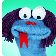
Exp A&D Puppets and Pop Ups