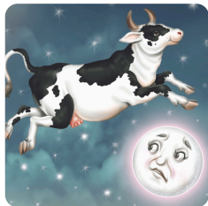
Literacy Stories and Rhymes