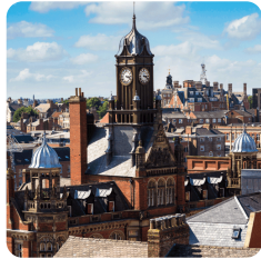
World Build It Up