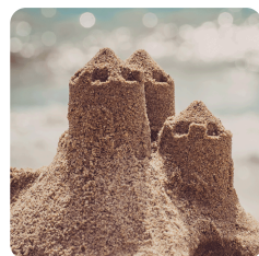
World On the Beach