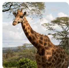
World Animal Safari