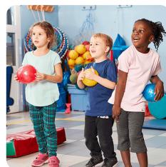
Physical development Move It