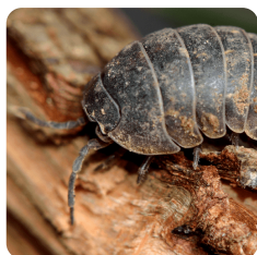
World Creep, Crawl and Wriggle