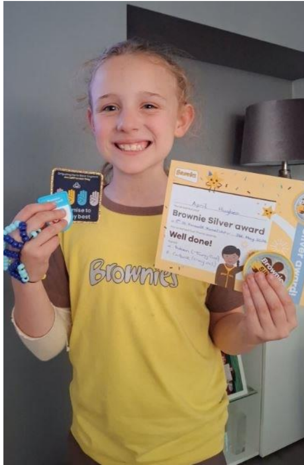
5 - April was presented with the Silver Award and 2 other badges at Brownies tonight.