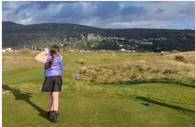
7 - Faith taking on the mighty Royal St Davids under the watchful eye of Harlech Castle.