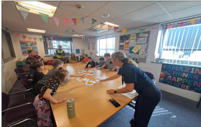
Emotional check-ins every session