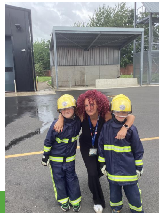
Rescuing Parish staff from the tower!