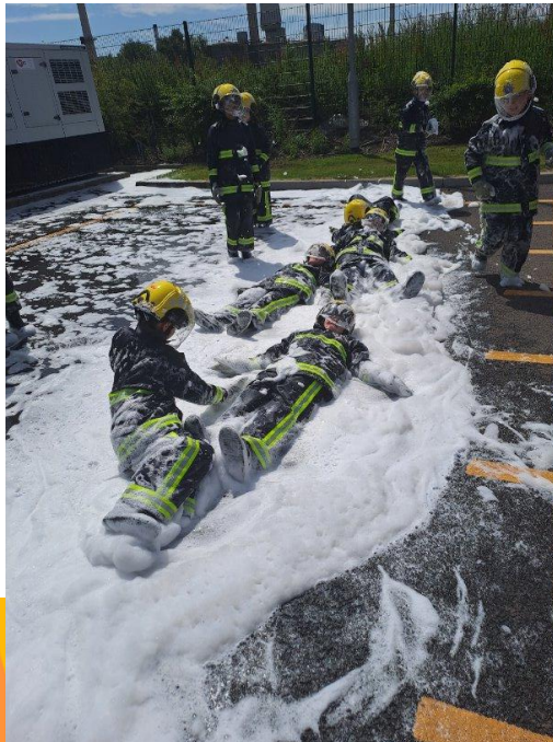
The foam drill