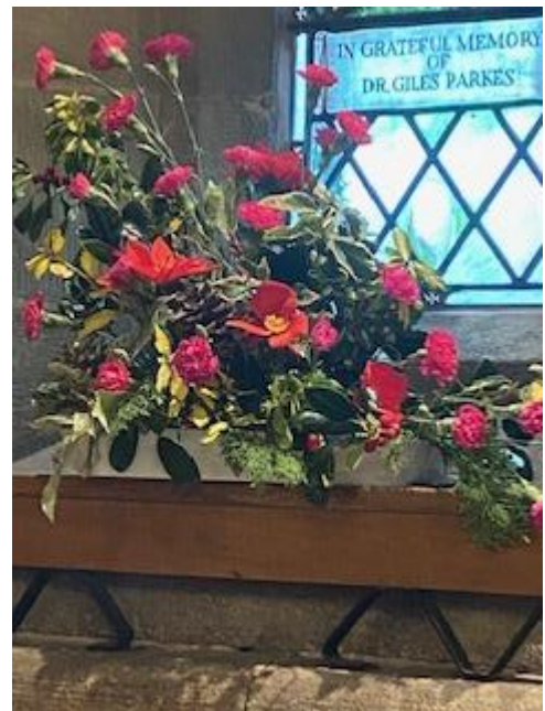
Christmas flowers at St Peter's