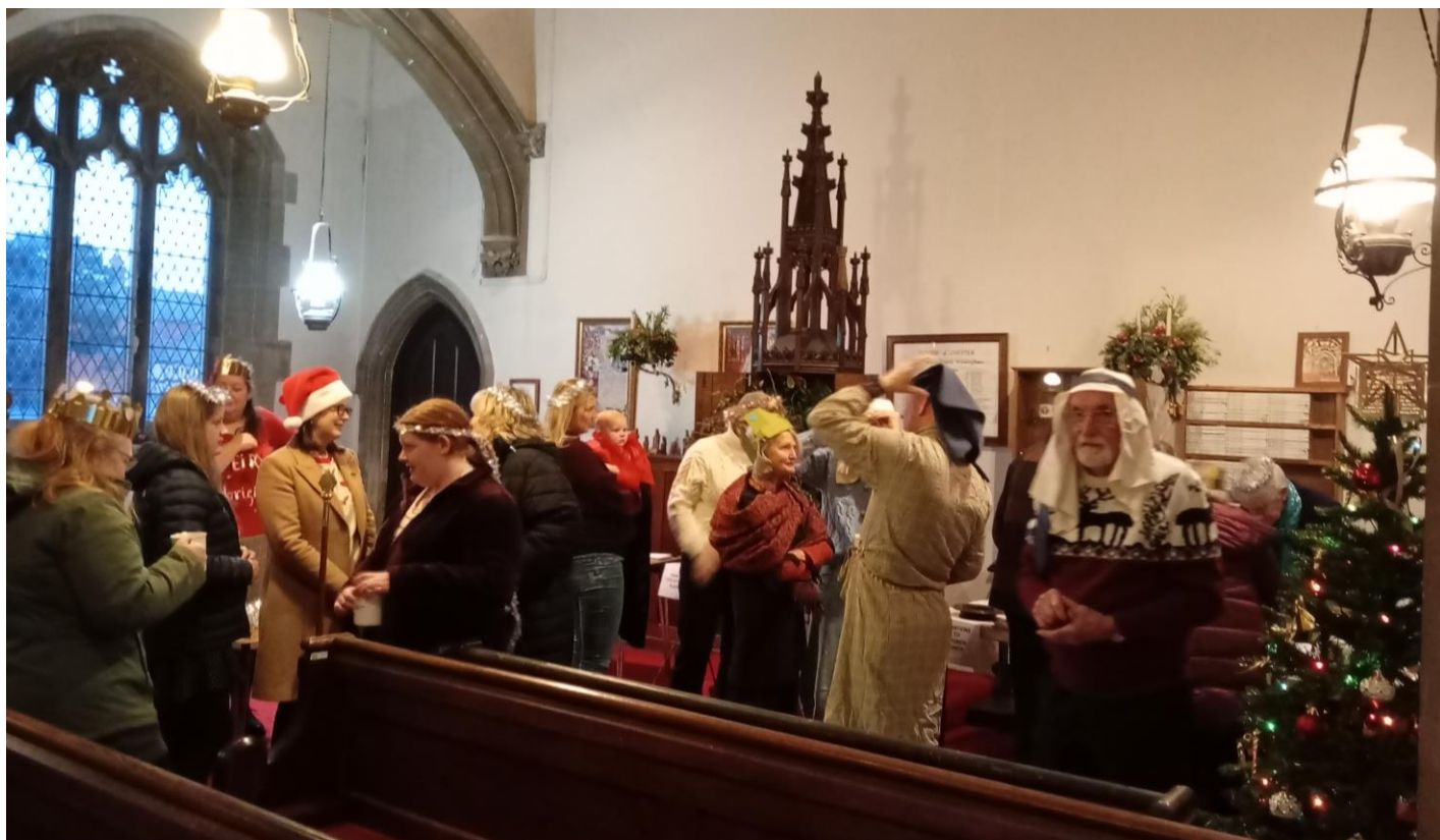
Interactive Nativity at St Leonard's, Sunday 21st December