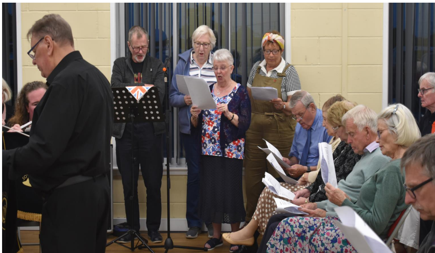
The South Cheshire Concert Band 80th VE Celebration Concert held in St Peter's Community Hall on Wednesday 7th May.