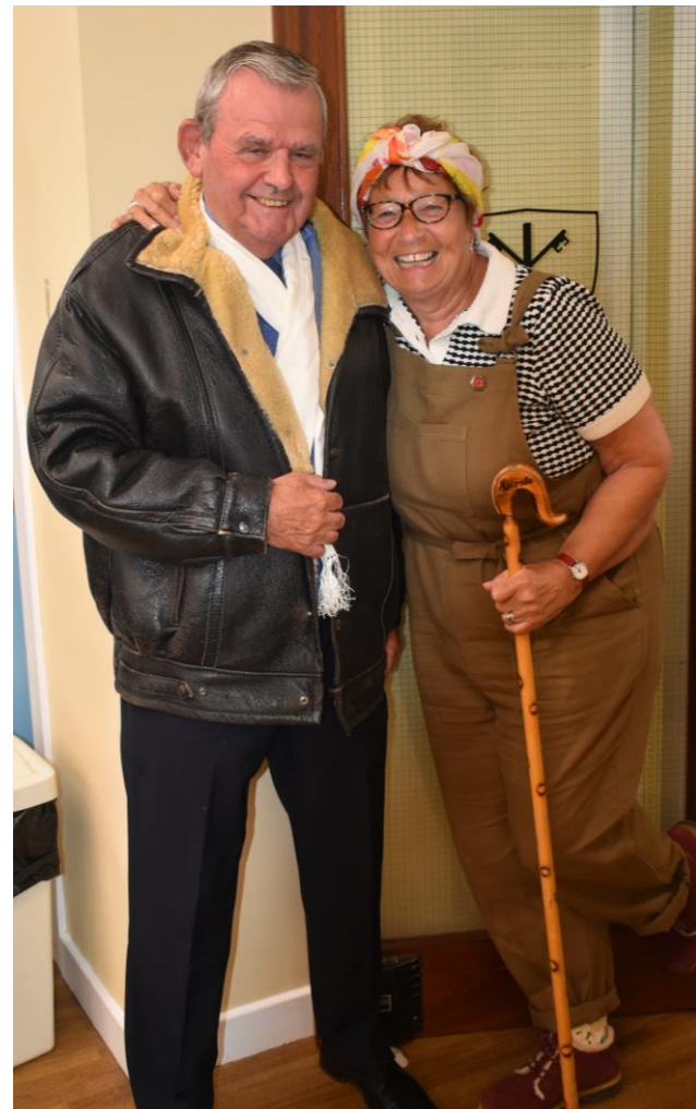
VE Day Celebrations at St Peter's