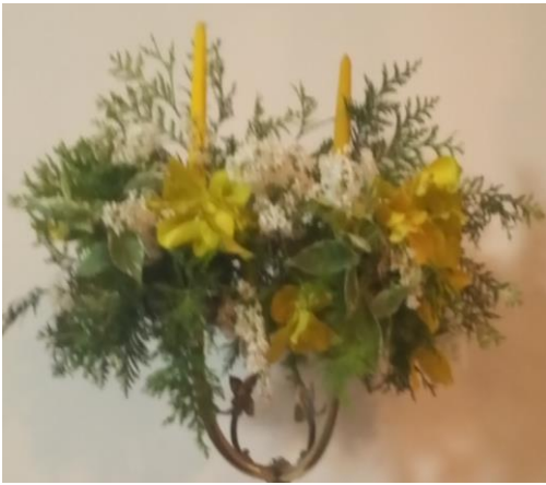
St Leonard's VE displays