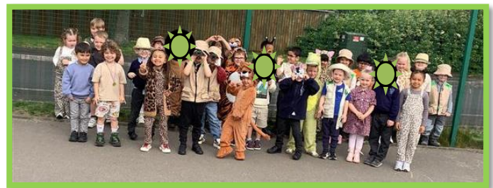
RECEPTION ON SAFARI 2026